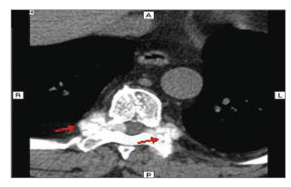
FIGURE 2. Computed tomography image: axial view of the tophi material at D8-D9 level (arrows)