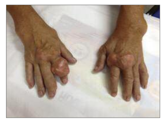
FIGURE 1. Gouty tophi visible on the 2nd right interphalangeal, bilateral 2nd and 3rd metacarpophalangeal and left wrist joints

In 2011, the patient presented a first episode of low-