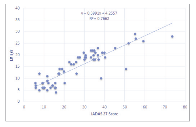
FIGURE 1. Regression curve showing that JADAS 27 is well correlated with LV E/E' (R2=0.76) and GLS (R2=0.82)

disease activity and level of inflammation in different subtypes of JIA. Disease duration, disease subtype as well as type of medications used failed to show any statistically significant correlation with LV E/E' and LV GLS.<sup>6</sup>