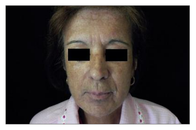
FIGURE 1. Skin thickness of face, microstomy