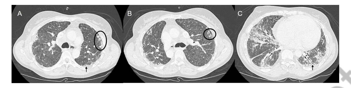
Figure 1 - Chest computed tomography showing ground glass opacities, with subpleural sparing (circle) and traction bronchiectasis (arrow). At lower lobes there are foci of patchy consolidation with air bronchogram (C).