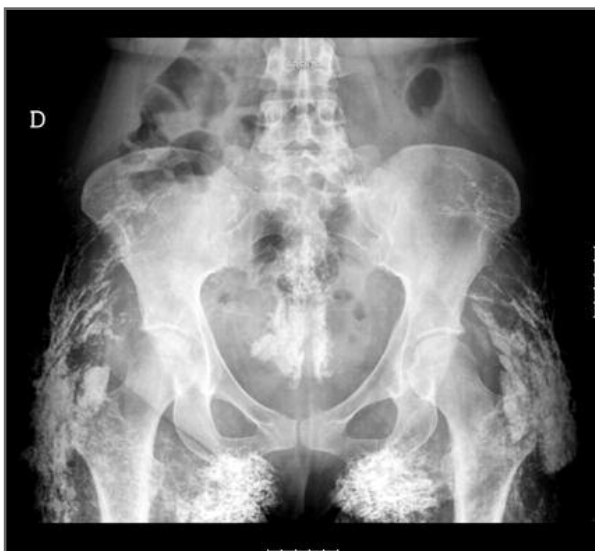
FIGURE 1. Extensive calcinosis lesions – hips

She was submitted to muscular and skin biopsy (left deltoid). The histology of the skin showed a discrete perivascular lymphoid infiltrate and slight hyperkera-