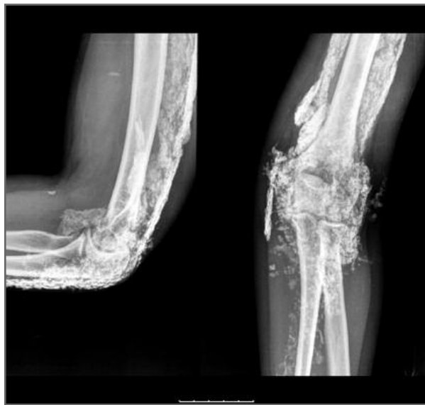
FIGURE 5. After 10 months of treatment with pamidronate – elbow