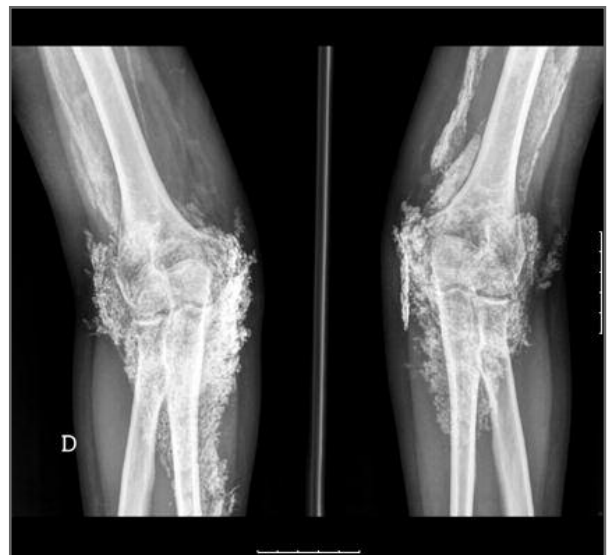
FIGURE 2. Extensive calcinosis lesions – elbows