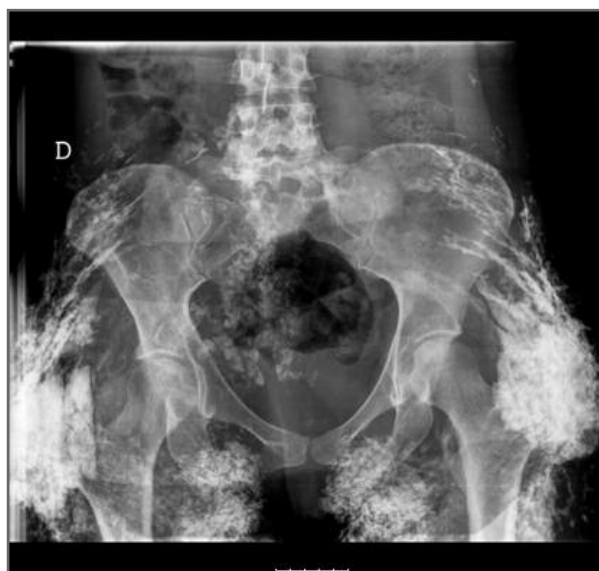
FIGURE 4. After 10 months of treatment with pamidronate – hips

There was some improvement on elbow flexion but no significant change in the calcinosis lesions.